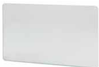
BoTouch glass pane, 2 mm, unprinted (chemical anti-glare treatment)

Scope of delivery: 1 enclosure frame with foamed seal, 4 clamps incl. screws, 4 screws for rear hood fixing