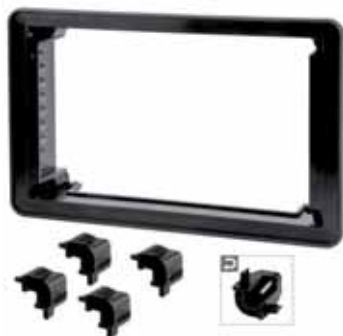
BoTouch front frame, plastic (PC UL 94 V0), black (similar to RAL 9005)