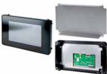
BoTouch Plastic Starter kit (black, similar to RAL 9005)

Note: Recommended for thin / delicate installation areas and IP protection requirement.