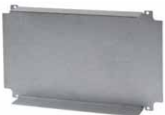
BoTouch rear hood (closed), 1 mm, mounting version, galvanised sheet steel, corrosion-protected