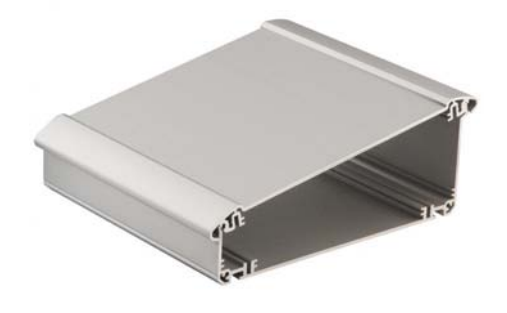
Alu-Topline has a recessed surface for mounting keypads or operating elements, e.g. hand-operated switches.