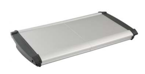
Special profile lengths or other modifications are available on request.