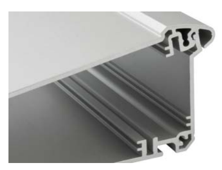
The profiles are equipped with various plugin slots and also screw channels for alternative uses for mounting circuit boards.