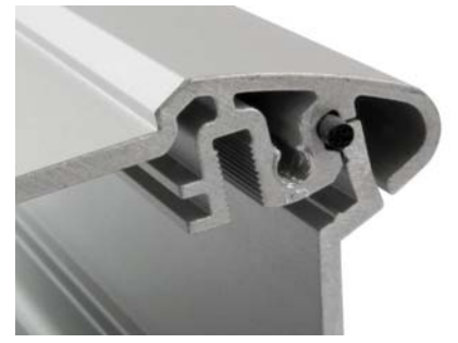
For protection class IP 54, in addition to seal AT...DI - available as an accessory - a round cord seal can be factory-fitted in the enclosure profile.