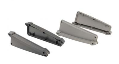
Plastic lids in quartz grey or graphite grey available as a profile end.