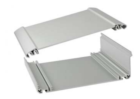
The divided enclosure profile ensures fast, easy mounting of the electronic components.