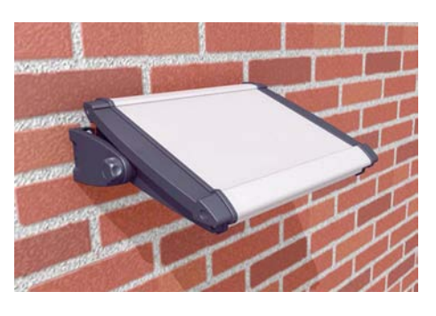
The enclosure offers a range of options for wall fitting.